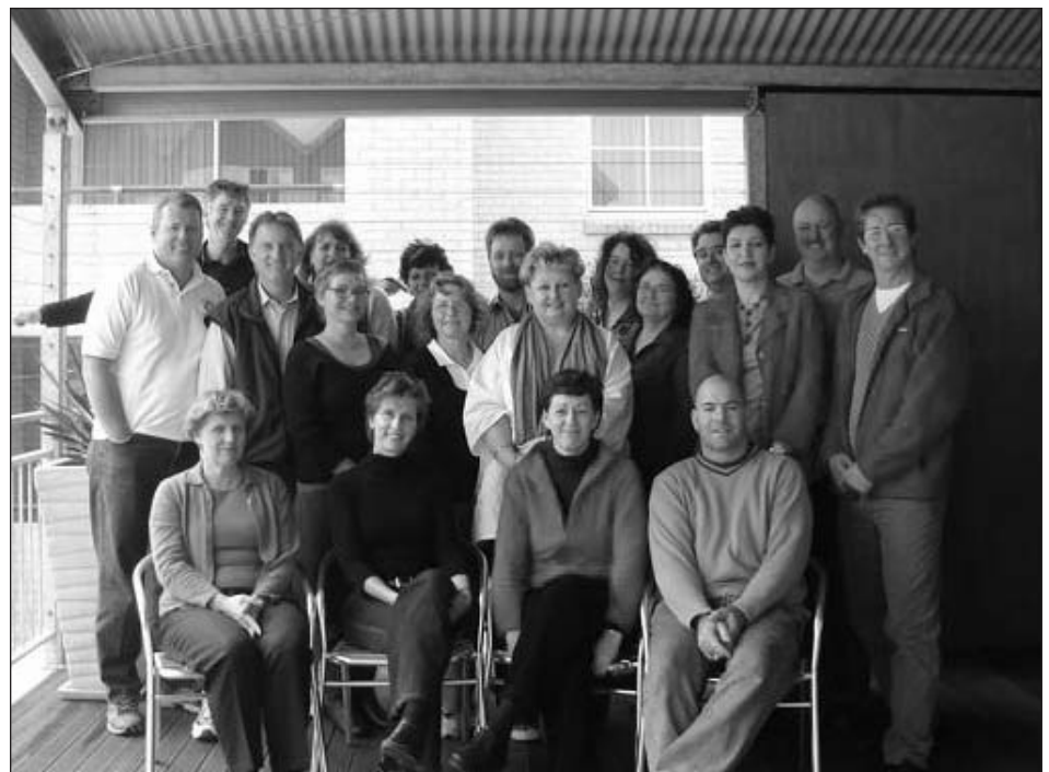
Western Australia Microboard Retreat team

I felt honoured to participate in this dynamic planning process with such a terrific group of folks. I'm looking forward to watching and participating in the evolution of the project in W.A. Look for additional updates in future newsletters.